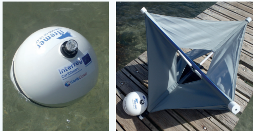
Release of drifting buoys measuring the currents

Several measurement campaigns are organized in the French West Indies, Trinidad and Tobago, Jamaica and Puerto-Rico. The objective is to collect data to feed numerical models that simulate current and future hazards (coastal erosion, marine submersion).